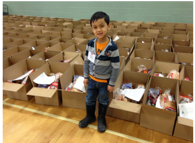
A young volunteer stands in front of hundreds of hampers that were packed and delivered on a single day by dedicated volunteers and sponsors.

Through our Co-ordination Service, we found 1,418 duplicate requests for food assistance at Christmas, as well as 1,938 duplicate requests for toy assistance (through the Salvation Army's Toy Mountain program). Combined these eliminated duplicates account for a total savings of $432,500 for our community! These duplicate checks allow