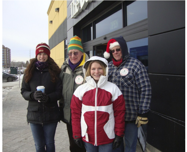
Volunteers brave the cold to collect bottles during the 26 th Annual Running on Empties event. (December 2013)

The Caring and Sharing Exchange was also named a recipient charity for events such as the National Capital Gala, Bon Appetit Ottawa, The Ottawa Gala, the Gift of Christmas, Shopping and Sweets event, and Royal Oak Day.