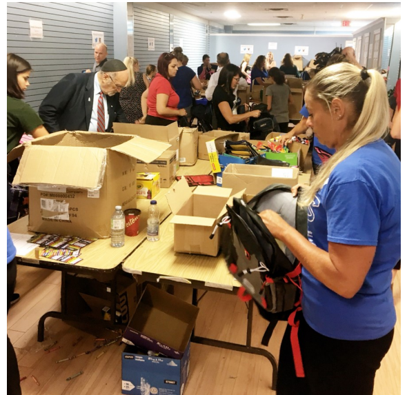
Volunteers and sponsors pack backpacks for SISS 2018.