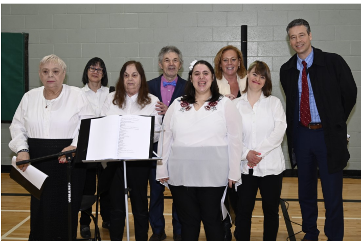
Musical guests from the Tamir Neshama Choir at the 12th Annual Kindness Week Launch event.

"Unexpected kindness is the most powerful, least costly, and most underrated agent of human change" — Bob Kerrey