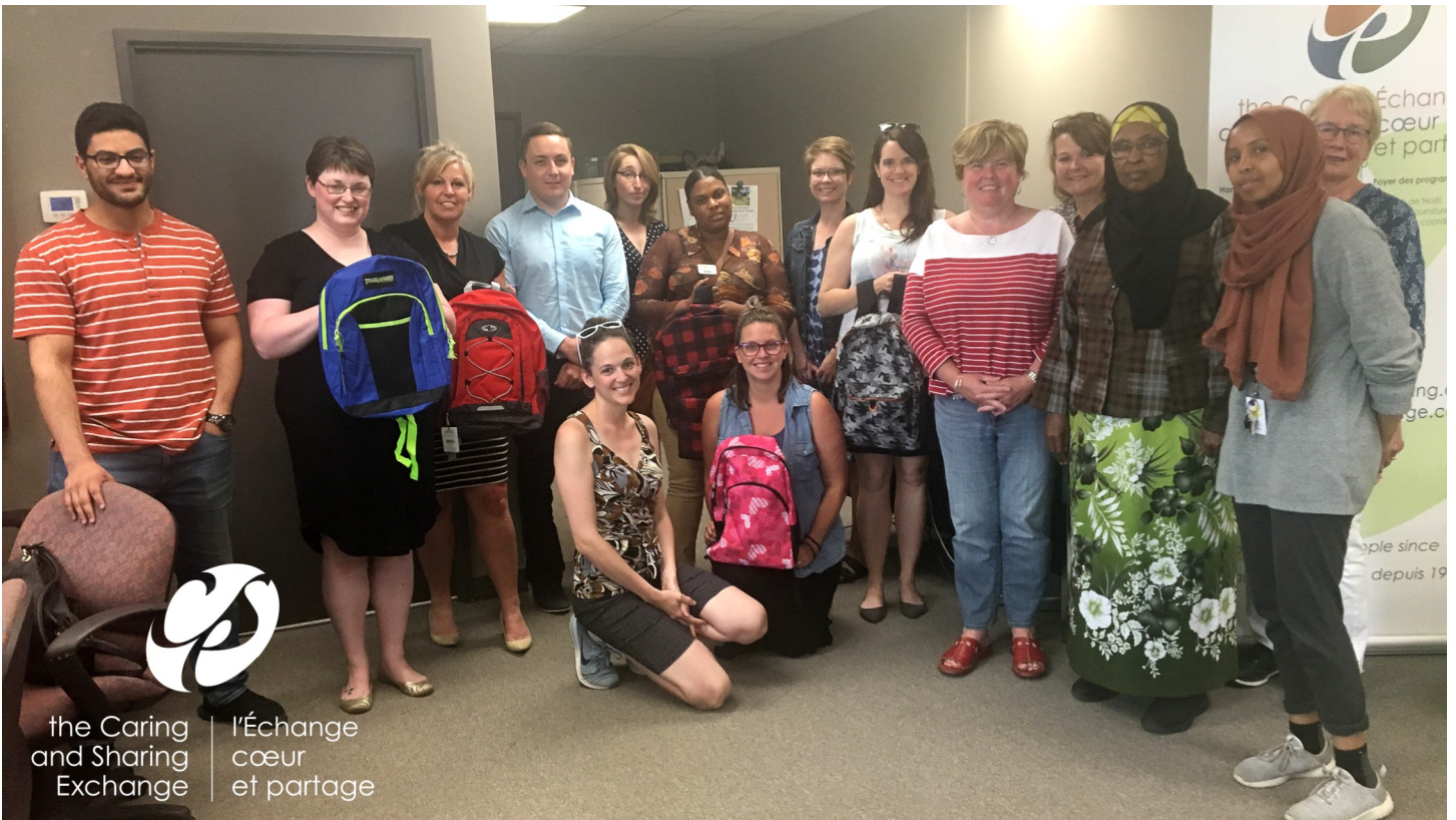
Our agency partners help us ensure assistance is distributed fairly and evenly in communities across Ottawa.