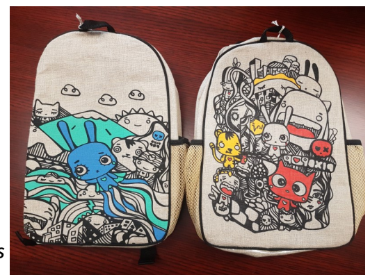
Backpacks for Sharing in Student Success 2018

*Names have been changed to maintain privacy