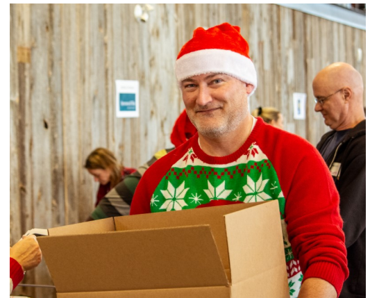
Sponsorship teams back hampers for hundreds of families in need in the Ottawa area.