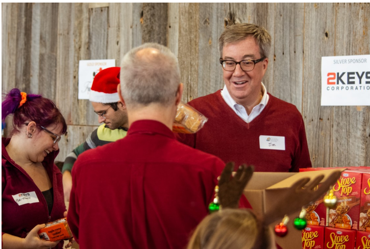
Mayor Jim Watson at the 6th Annual Hamper-Packing Event packing hampers for families in need.

In the last 31 years, the event has raised close to $400,000 and has helped provide thousands of families with much-needed support at Christmas time. Thank you to the Beer Store and our amazing volunteers.