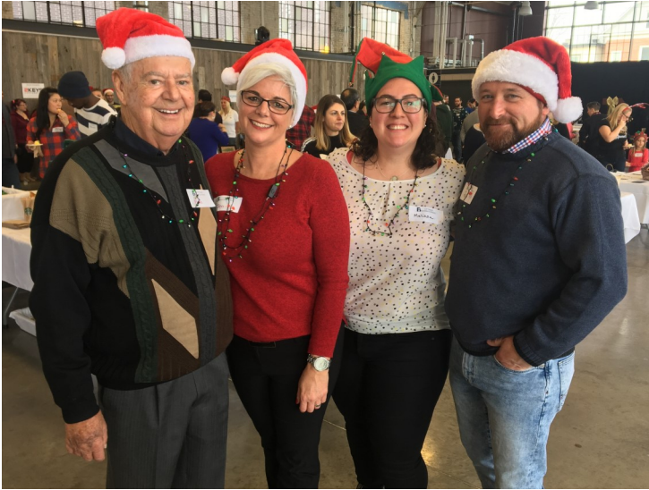
Generous representatives from Ottawa Business Interiors at the 6th Annual Hamper-Packing Event at Lansdowne.