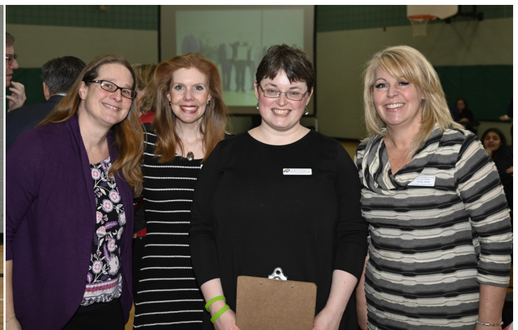
Members of the Caring and Sharing Exchange team that celebrating Kindness Week in Ottawa at the 12th Annual Kindness Week Launch at Accora Village.