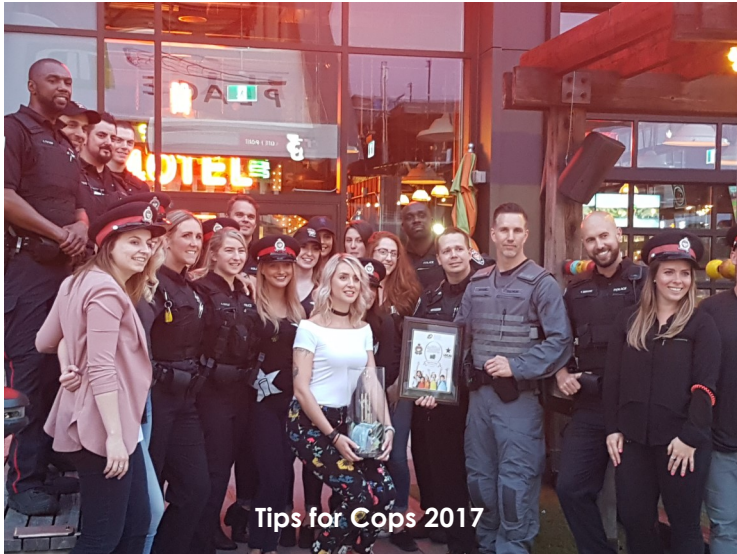
Tips for Cops 2017

To all the event organizers, the Ottawa Police Service, the local businesses that provided raffle prizes, LOCAL Lansdowne, and all those of you that came out to the event, THANK YOU!