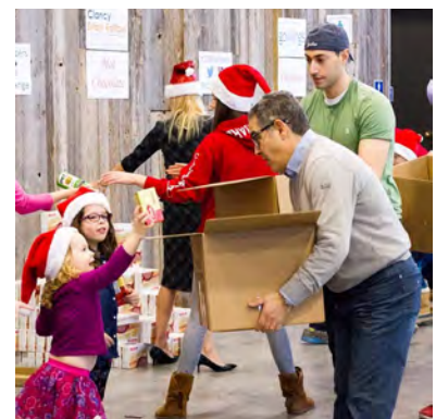
"A little lower, please!"