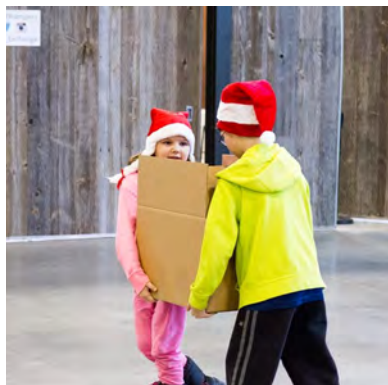
Two young volunteers