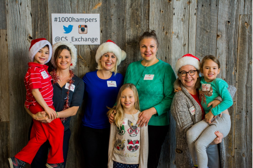
A group shot of some of our amazing volunteers for 2016's Corporate Hamper-Packing Day (December 21st, 2016).

On December 21<sup>st</sup>, generous corporate sponsors and community volunteers gathered at the Horticulture building at Lansdown park to pack and deliver over 500 Christmas hampers to individuals and families in need within our community, all within a single day! This incredible achievement would not have been possible without the amazing support of our event sponsors: Halogen, Innovapost, The Foundation for Giving, Miller Waste Systems, NAV Canada, Taggart Parkes Foundation, TD, CLV Group, Conlin Bedard, Donna Cona, Emond Harnden, Momentum Law, TELUS, Welch Consulting, Waste Connections Canada Inc. and 360pi.