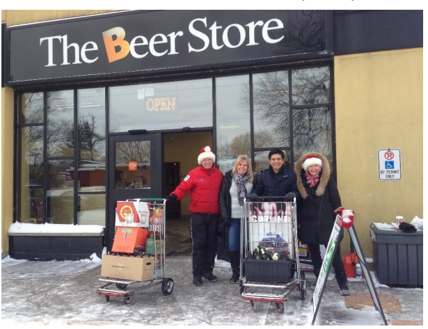
Returning empties to The Beer Store at our 29th annual Running on Empties event (December 17th, 2016).

On December 17<sup>th</sup>, 2016, volunteers and community leaders were stationed at 35 beer store locations across the City of Ottawa to collect empties for our 29<sup>th</sup> Annual Running on Empties event, raising over $10,000 ! Since the partnership began, the event has raised well over $350,000 in support our Christmas Exchange program.