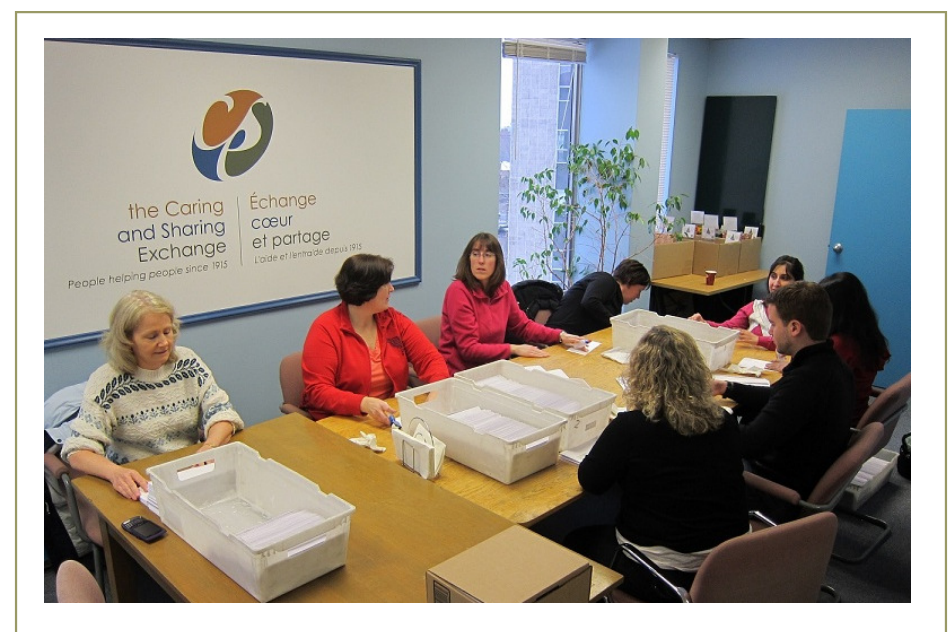
Volunteers of the Caring and Sharing Exchange preparing Christmas gift-vouchers to be mailed out to low-income families in the Greater Ottawa Area.

This year over 5,200 redeemable Giant Tiger gift certificates were mailed to our clients, and 263 hampers were delivered.