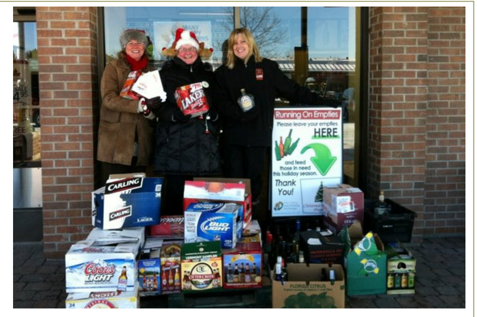
Volunteers collecting empty bottles to raise funds for the Christmas Exchange Program, during the 24th annual Running on Empties fundraising event.

All the volunteers gave their time to help with various activities ranging from envelope stuffing of our donor mail-outs and gift vouchers, data entry of client referrals, toy centre phone calls, hamper packing and