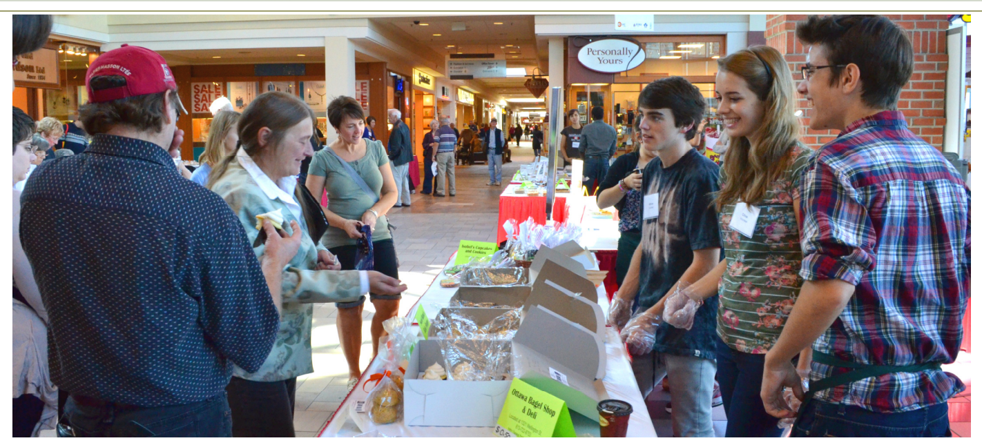
Volunteers selling baked goods at the 11th annual Ottawa's Biggest Bake Sale, in Billings Bridge. There was also a Besttasting Pumpkin Pie Contest, a raffle and the ornaments were on sale.

delivery, general office administration, to helping out at special events.