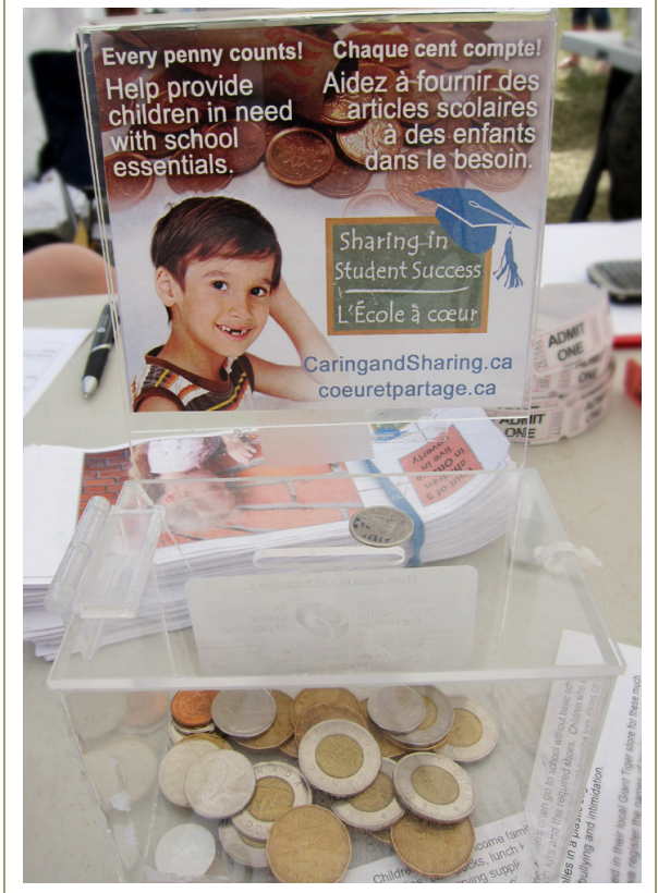
In order to help the Sharing in Student Success program respond to growing needs, every penny counts!

The Exchange drew down on reserves created in previous years in order to provide more assistance to students in the Sharing In Student Success program and to families and