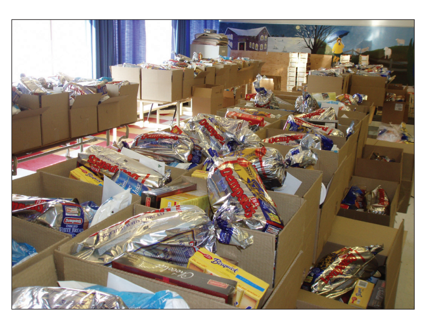
Full hampers wait to be delivered